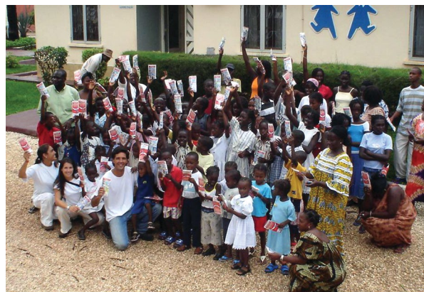
Group photograph of the Guinea Bissau Dental Project supported by Fellows ICD Section V Europe