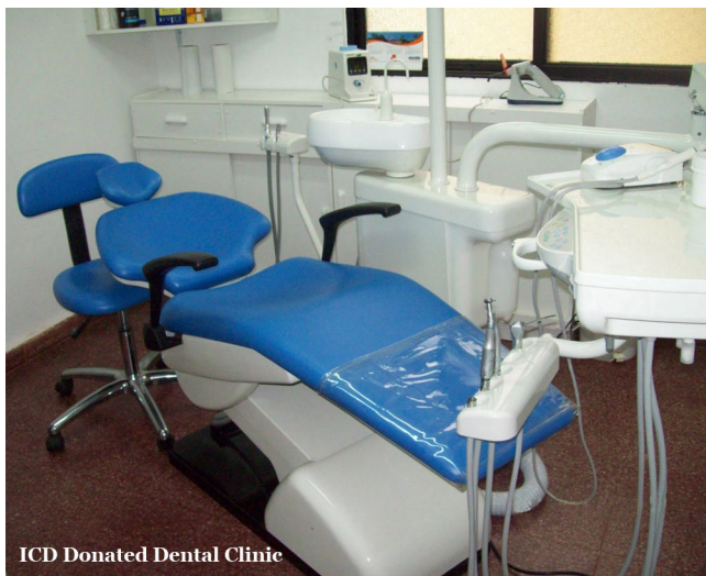
ICD Donated Dental Clinic

At the time of the dedication of the clinic, the Chile District of ICD Section IV South America recognized the financial assistance of ICD Section XI Korea with this message "The Chile District very much wants you to know that your generous and spontaneous donation strongly stimulated the local ICD Fellowship to launch this extraordinary philanthropic project." On the weekends, volunteer Chilean Fellows will be providing volunteer dental services at the clinic.